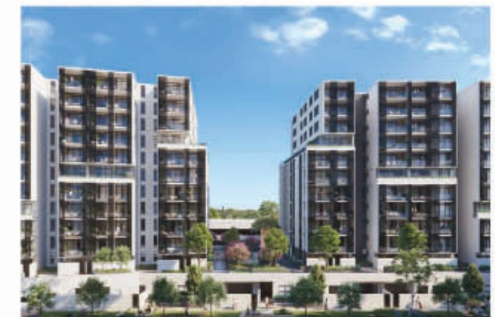
Evo Fairfield BC